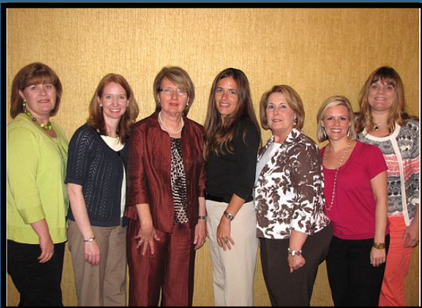
Former and current TACME board members gather. Without their and others hard work, this conference could not occur.